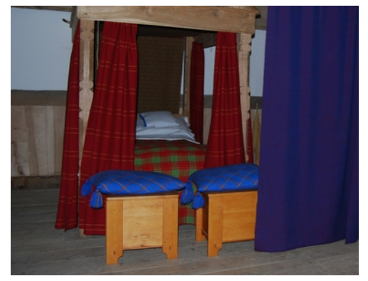
It looks like this ordinary